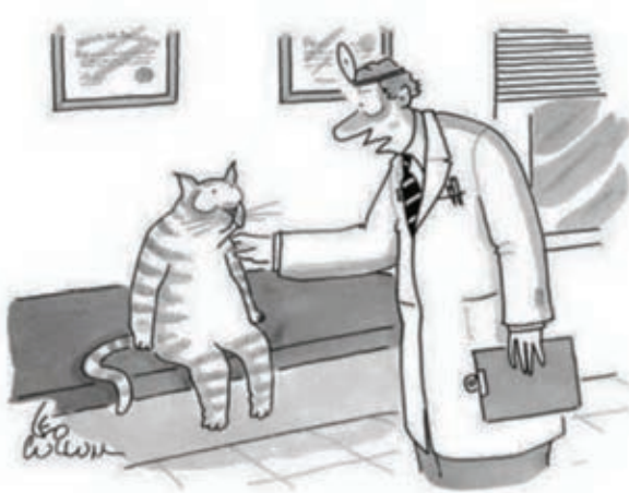
"Bad news, its curiosity"