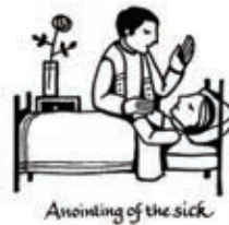
Anointing of the sick

Sanctuary Candle: For a $10 donation, the sanctuary candle will burn for one week for your intentions Sunday through Saturday.